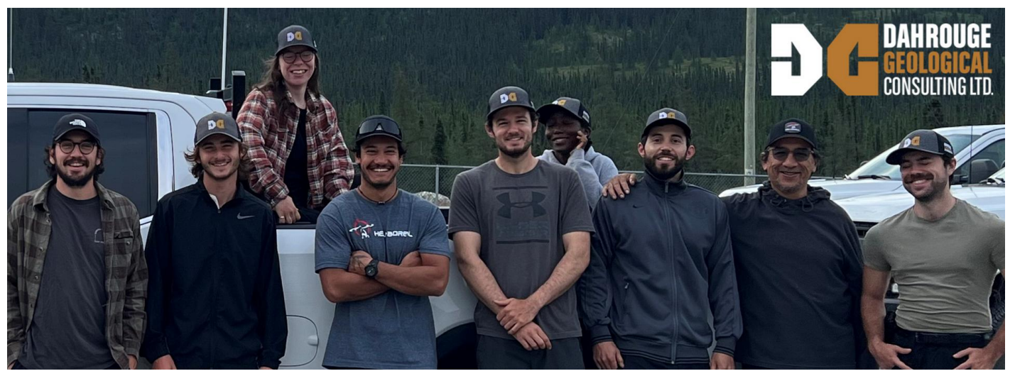
Photo 1: DGC Geologists at the Renard Processing Plant ready to begin the Trieste Lithium Project 2024 Field Program.

Loyal Lithium's geological contractor, Dahrouge Geological Consulting, has arrived on site and set up base at the Renard Processing Plant, which is only 50 km south of the Trieste Lithium Project. The accommodation at the Renard Processing Plant is much closer than the base camp used for the 2023 Field Program, significantly reducing the forecasted cost of the field program.