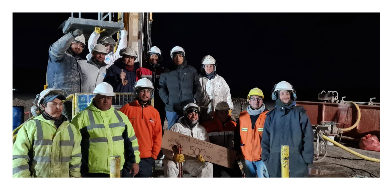
Figure 2 – Pursuit's on-site drilling team following completion of DDH-2 to a depth of 500m

Following completion of DDH-2, Pursuit is currently awaiting environmental approvals to commence drilling at DDH-3 which is to be relocated to the Mito tenement in the north section of Rio Grande. Pursuit is targeting a material resource upgrade in 2024, which will build on the recent maiden resource defined at the Rio Grande Sur Project.<sup>1</sup> The adjustment of DDH-3 from the southern section to the northern section is focused on maximising this resource upgrade target, with intercepts of ~900mg/l Li obtained from an adjacent project some ~2km to the east of the proposed location of DDH-3.