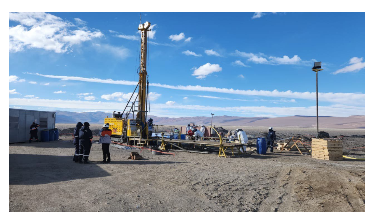
Figure 1 – Drilling crew onsite drilling DDH-2

Throughout the first several hundred metres, the on-site geologists and drilling team have been extremely encouraged by the geological units encountered with many comparables to the favourable geological units of DDH-1 at the Maria Magdelena tenement.