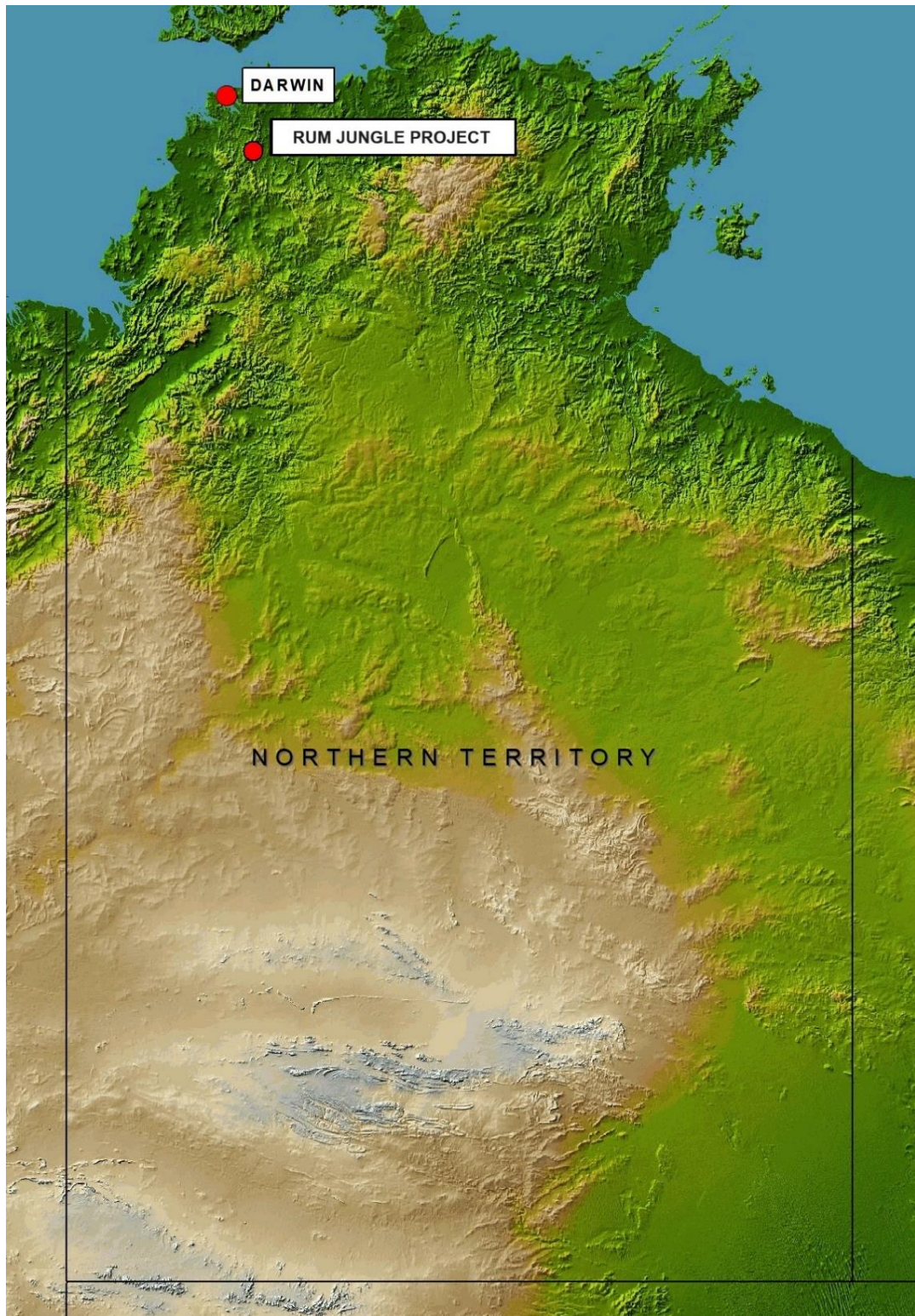
Figure 1 Rum Jungle Project Location