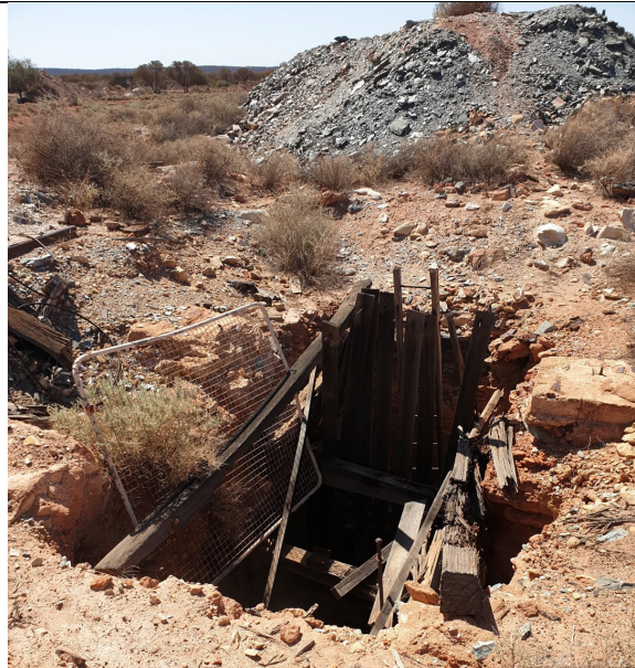
M31/481 Senate Mineshaft circa 1930’s