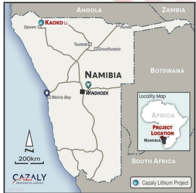
Figure 2. Location of the Kaoko lithium project.

The Kaoko lithium project is located approximately 800km by road from the capital of Windhoek and approximately 750km from the port of Walvis Bay (Figure 2). There is excellent infrastructure in the region with the project being only ~50 km from the regional capital of Opuwo, with an airport, good bitumen roads, and access to the 320 MW Ruacana hydroelectric power station. Transmission lines run through both the western and eastern parts of the project.