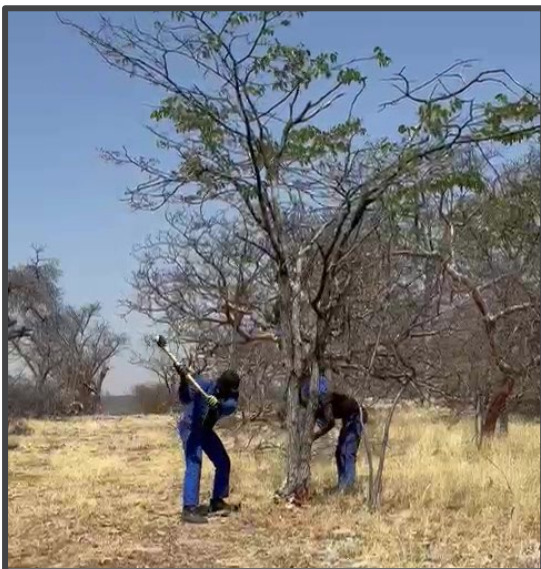
Figure 3. Hand clearing to provide drill rig access.

Following renewal of the Environmental Clearance Certificate (ECC) for exploration licence EPL6667 late in the June quarter, field preparations commenced to accommodate drilling activities (Figure 3). A team of local workers were employed to undertake line clearing and site preparation activities and will continue to provide assistance during the drilling programme (Figure 4).