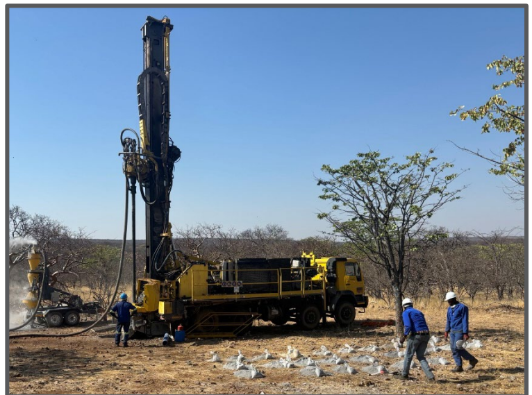
Figure 4. Drilling in progress at Kaoko.