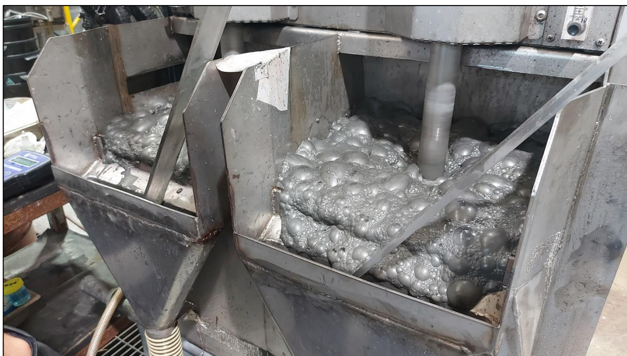
Figure 3; Photo showing sulphide flotation testwork being undertaken on the non-magnetic tail.