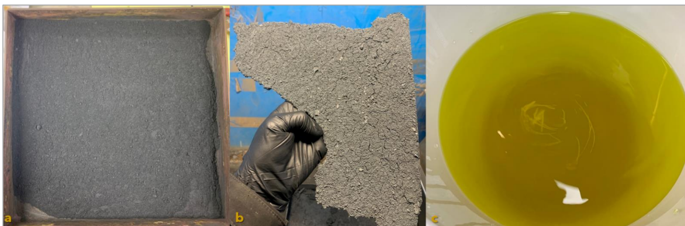
Figure 1; Photos showing a) Magnetite Concentrate prior to roasting, b) calcine product post roasting, and c) Vanadium bearing solution after leaching.

The roasting of the remaining sample has successfully been completed, with an 89.3% recovery of Vanadium into 15 litres of V_2O_5 solution. This is now undergoing further steps to produce the high purity V_2O_5 flake and electrolyte. The Company anticipates being able to provide results of the testwork in the coming months.