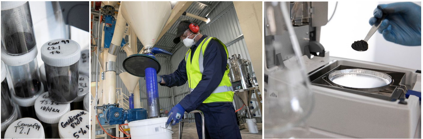
Caption: Sample product, plant operations and laboratory testing at the IG6 Collie facility.

ISO 9001 is the most globally-recognised standard for quality management systems. The certification, issued by SGS Global, covers the processing, assaying and supply of graphite to agreed specifications 1 .