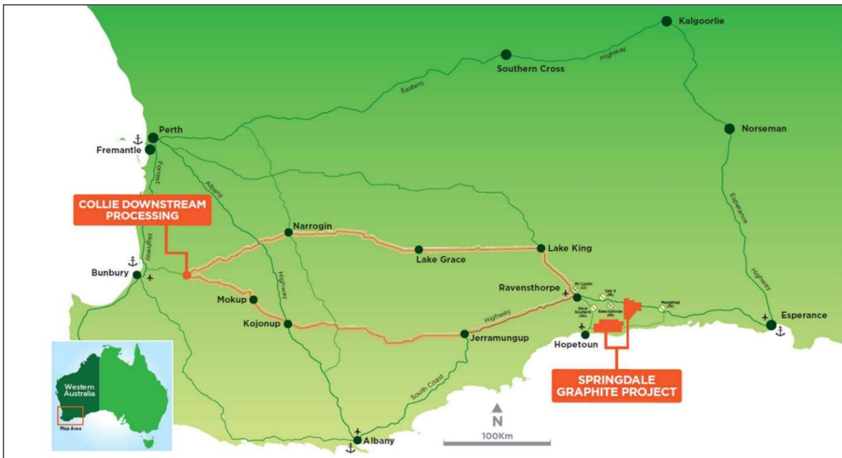
Figure 1: Location of International Graphite projects, in Western Australia

“Springdale has enormous expansion potential. Only around 25 per cent of the targets identified in previous aeromagnetic survey have been drilled. We expect further exploration and infill drilling will add considerable mine life beyond that which was generated in our scoping studies.”