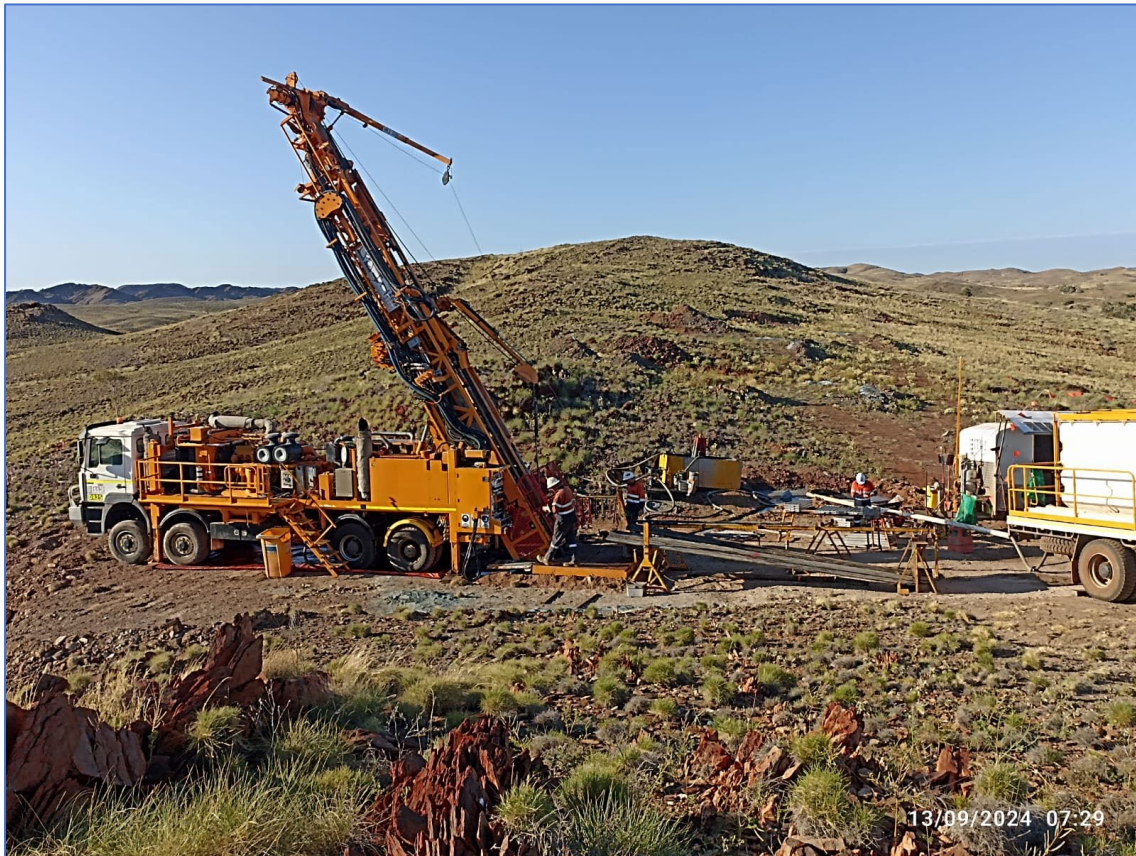
Figure 3 Drilling rig in action at the Tambourah Gold Project.