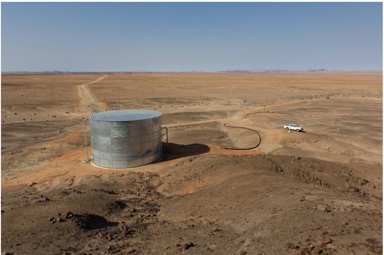
Figure 3: Completed construction water reservoir delivering 700m 3 storage volume