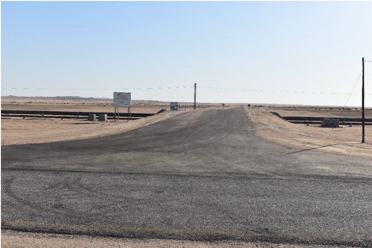
Figure 1: Completed access road to Etango site, showing the junction to the C28 tar highway

The first two early works contracts approved for the Etango Project – the construction water supply and site access road – were completed in July; safely, on time and on budget. Bannerman thanks its local contract partners on these projects for their strong and safe performance.