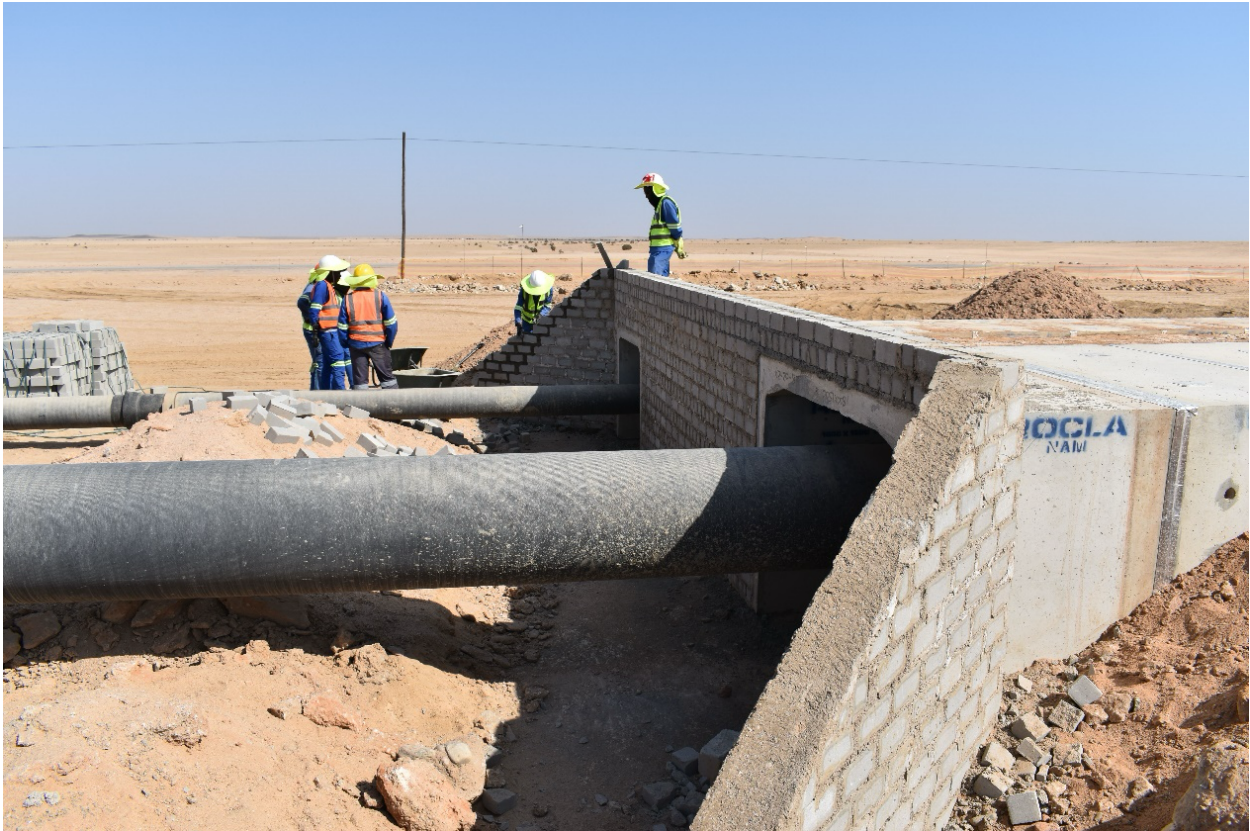
Figure 2: New culvert installed over the existing water supply pipelines