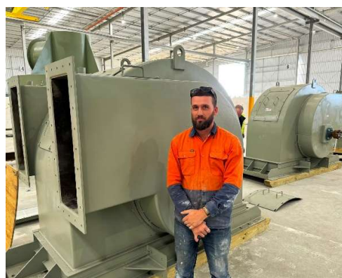
Classifier components from USA