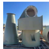
Auxiliary items ready to install after the main drive units arrive