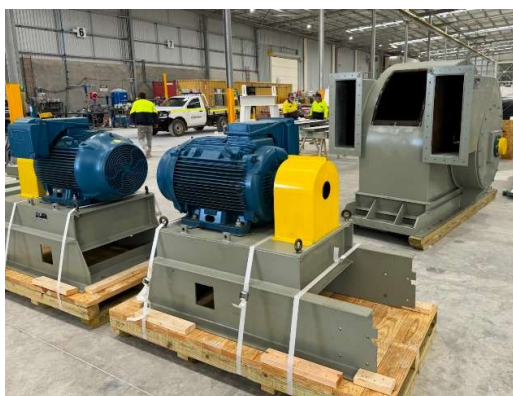
Classifiers components drives from USA