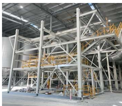
Structure ready for installation of Classifiers