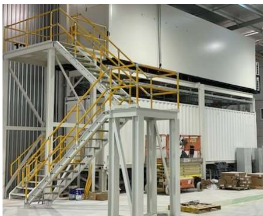
Classifiers MCC (upper level)

The motorised sections of the two classifiers have arrived at Wickepin from overseas on 25th September after a delay at the Fremantle port. All other items including structure, transfer equipment, motor control centre and drives are all in late stages of readiness (see photos below). The capital cost of the project is within the $3m budget. Commissioning will occur in October/ November 2024.