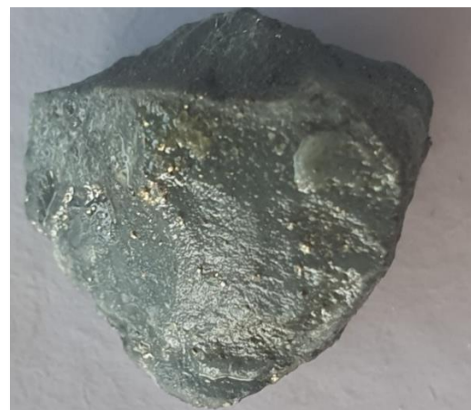
Figure 5 – Typical Example of the mineralised chert unit. Note the high pyrite content. Specimen is approximately 15mm wide.