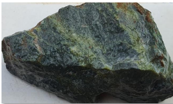
Figure 4 – Typical Example of the Rookwood Volcanics. Specimen is approximately 30mm wide.

The mineralisation is hosted in a cherty unit within the Rookwood Volcanics. The volcanic rocks as seen in the drilling so far have shown a high degree of variation. The mineralisation however is rather uniform and has a distinct high pyrite concentration (Figures 4 and 5).