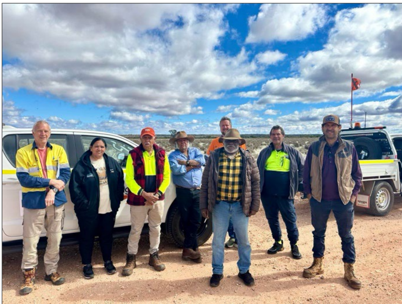
Figure 1. Kakarra Part B Elders and People at the completion of Aboriginal Heritage surveys for the Manna Lithium Project.

Resolution of all objections will allow for the granting of all required Miscellaneous Licences for key Project infrastructure. Environmental approval applications have been prepared and will be lodged with the relevant regulatory bodies upon grant of all required project tenure.