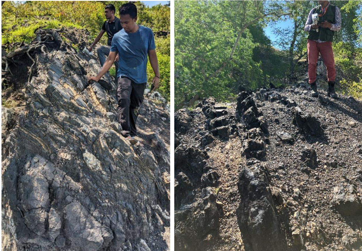
Figure 4: Estrella geologists mapping outcropping bedded chert and manganese horizons with supergene enrichment and abundant manganese mineralisation (70% Manganese Oxide and 30% Chert). The Company is awaiting assay results and will likely release them next week.

Of most interest within the application landholding is the prevalence of bedded manganese rich outcrops as shown in Figure 4. The manganese, interbedded with thin chert horizons, are typical of exhalative style mineralisation associated with the thrusting and uplift of the Timor Island, and subsequent hot fluid flow onto the sea floor. Subsequent supergene enrichment has upgraded mineralisation further.