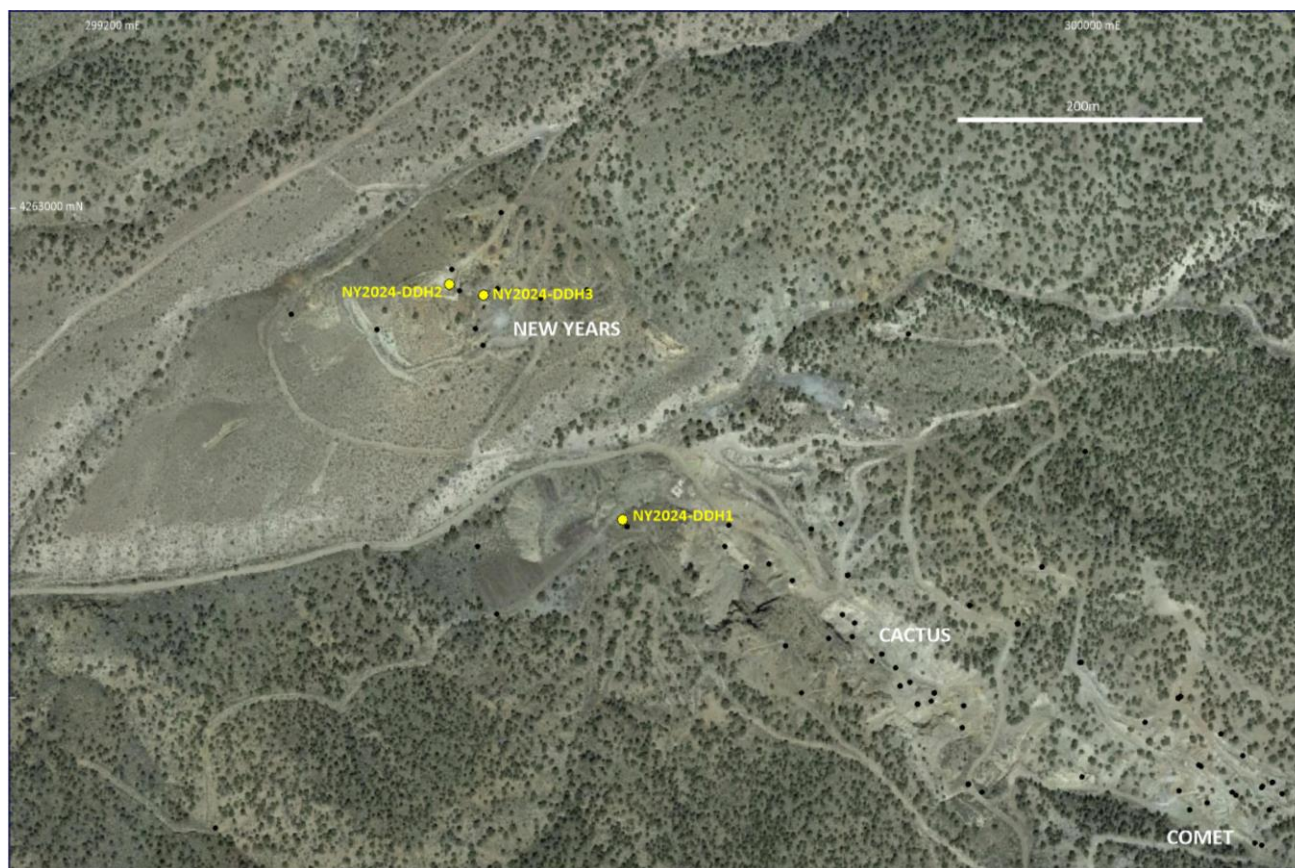
Figure 3: Alderan's drill holes (yellow) and historical holes (white) at New Years plus the location of the Cactus and Comet historical copper-gold mines.

2.32% Cu within 19.8m @ 1.67% Cu from 22.9m downhole. The third hole, NYM-1 which was drilled in 2002 and intersected 10.7m @ 1.60% Cu and 4.6m @ 1.3% Cu within 42.7m @ 0.80% Cu from surface, had up to four different locations in old reports with the most likely site believed to be the co-ordinates on the original drill log. This placed the hole midway between the historical Cactus copper-gold mine and the New Years prospect.