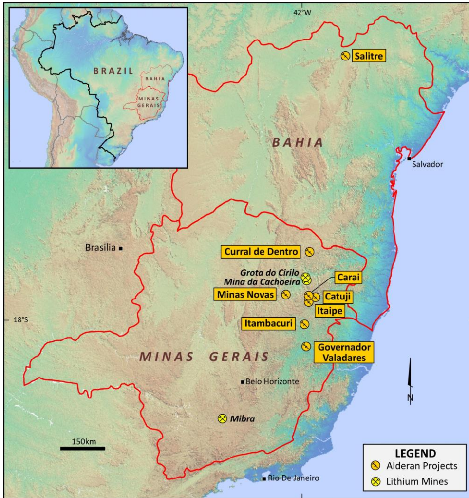
Figure 6: Alderan Resources project locations in Minas Gerais and Bahia, Brazil.