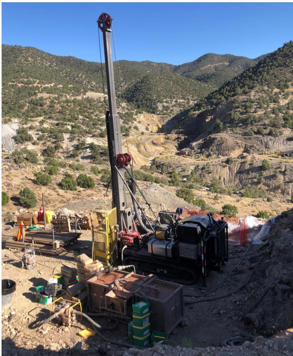
Figure 4: NY2024-DDH2 looking southeast with the historical Cactus copper-gold mine workings in the background

disseminated in the tourmaline matrix. Visible pyrite and chalcopyrite sulphide mineralisation occur from around 37m downhole and extend to the end of the hole at 121.9m. The hole intersected a 1.5m void at a depth of 90m which is likely to be an opening from the old mining at New Years. pXRF readings along the length of the hole are in progress.