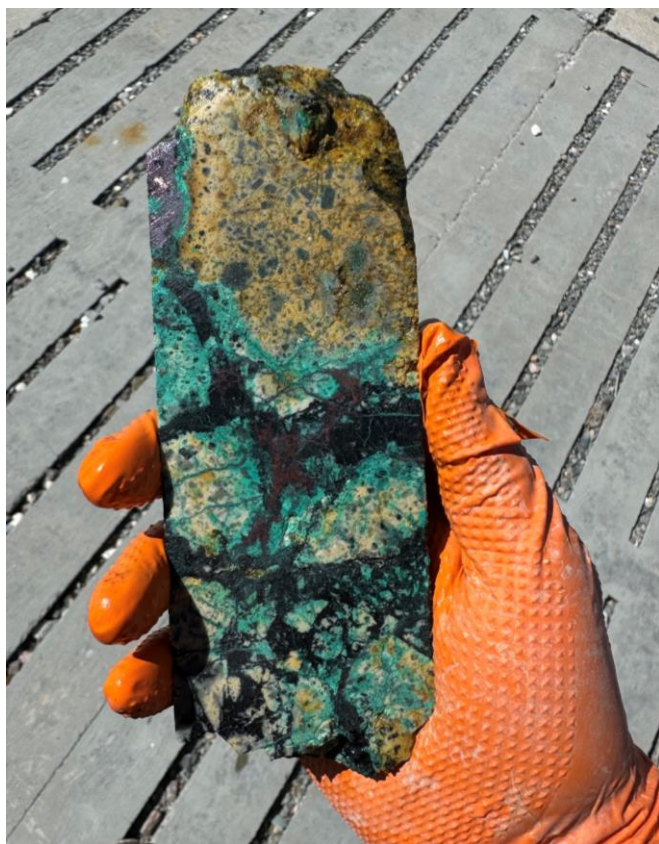
Figure 2: NY2024-DDH2 drill core at 14.0-14.2m downhole. The pXRF copper grade over 3 readings averages 23.2%.

The Stage 1 drilling at New Years is a three hole (319m) programme aimed at verifying copper mineralisation intersected in historical holes drilled in 1964 and 2002 plus identifying geological controls on mineralisation. 1 Stage