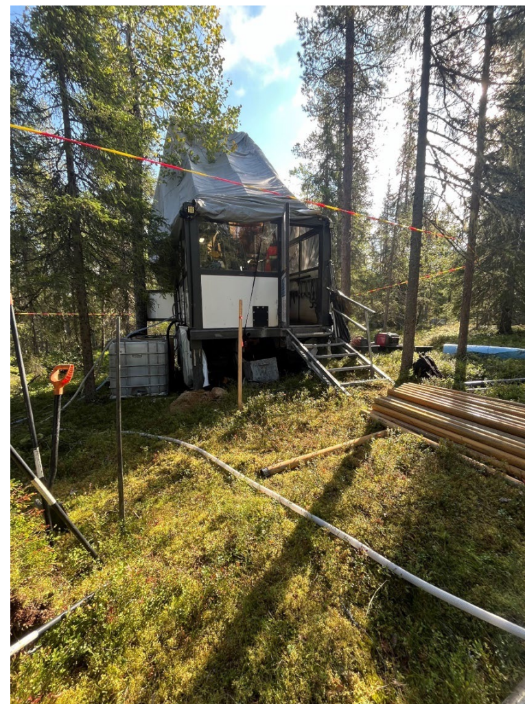
Figure 2: Drilling at K9 Prospect, KSB Project