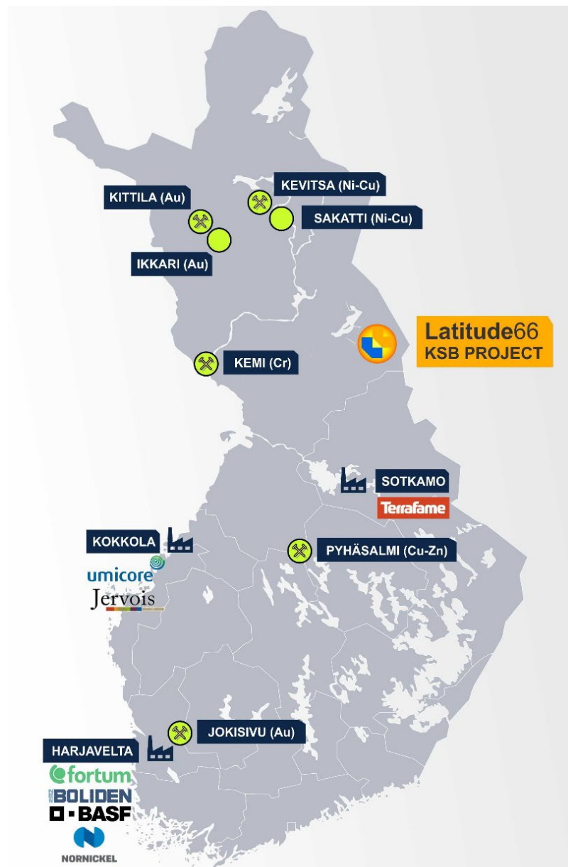
Figure 3: KSB Project location map

A number of diamond holes at K9 and K8 have been identified as being amenable to DHEM with a geophysics crew engaged to complete the planned activities in mid-October. Results from this program will be used in the next phase of drill planning. In addition to the drilling activities, field crews have been taking advantage of the summer period by completing lithological and structural mapping and rock-chip/boulder sampling.