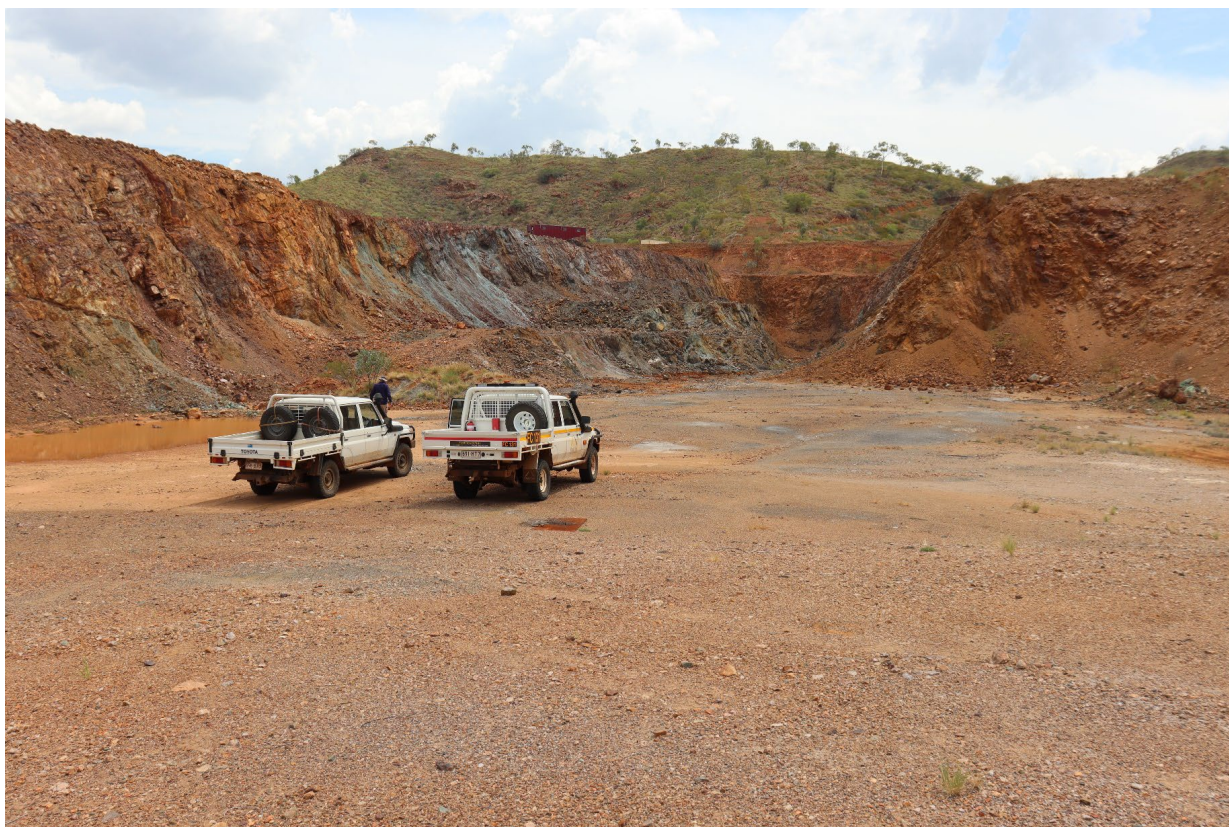
Figure 5. Lady Jenny mining pit looking south.