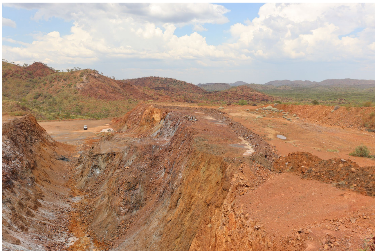
Figure 2. Lady Jenny mining pit looking north.

"As the region looks to establish the next set of mines to replace the Mount Isa copper operation, advanced prospects such as Lady Jenny, with proven production potential, will have a tremendous opportunity to expeditiously deliver the mines of tomorrow. The added bonus of this prospect is that it is located on a granted Mining Lease, with Hammer holding all of the tenure surrounding the established mine."