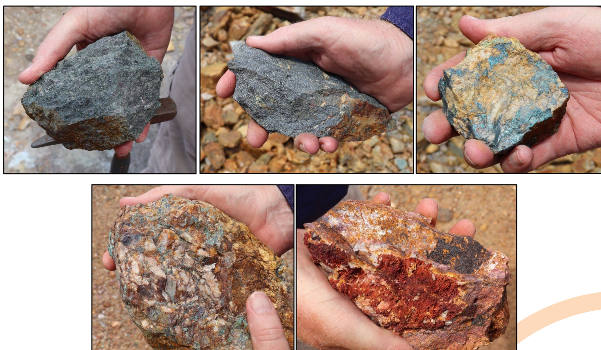
Figure 4. Examples of in-pit mineralisation, from left to right, Samples 1 to 5 (Table 2 and see note below).*