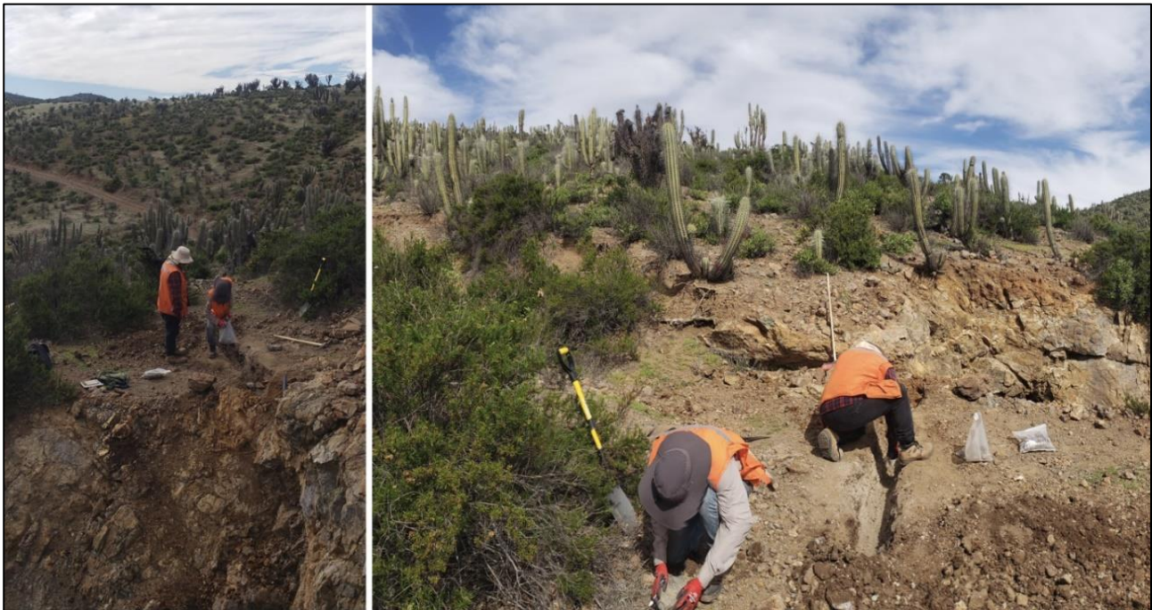
Figure 2: Trenching at an andesite outcrop with silica-albite-sericite alteration within a silicified and brecciated structure. Mineralisation shown to consist of quartz, iron oxides, and copper oxides. Samples CPO0009117- CPO0009118- CPO0009119 Trench 1 (5.5m at 0.88% CuEq).

"The reported composite intersections for the trenching are generally calculated over intervals >0.2% CuEq and where zones of internal dilution are not weaker than 2m < 0.1% CuEq, no top cut has been applied. Bulked thicker intercepts may have more internal dilution between high-grade zones. Isolated mineralised intersections less than 2m length have not been reported".