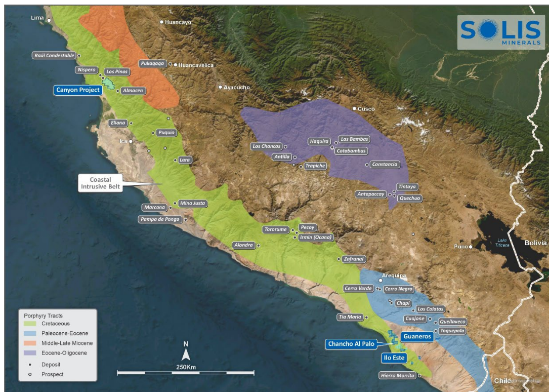
Figure 1: Coastal Intrusive Belt as indicated in green. Canyon is located in the NW of the figure, with Solis' other projects (Ilo Este, Chanco Al Palo, Guaneros) located in the SE. Other intrusive belts shown in different colours. Geology and data points derived from USGS* (*refer JORC tables).

The application area is approximately 22km by 12km and the geology predominantly consists of granodiorite and tonalite. These intrusive rocks dip steeply to the west with structures aligned along NW-SE strike. Prominent high-angle faults cut across strike and seem to localise the occurrences of porphyry style mineralisation within the intrusive rocks (refer Figure 2).