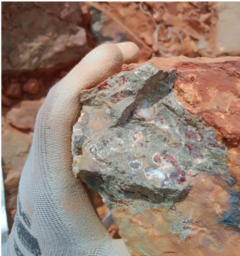
Figure 3: Amygdaloidal intermediate-mafic volcanics identified at the Guinness Prospect area, Mt Maguire Project

The proposed follow up exploration program will involve initial mapping followed by geophysical surveys to test the mineralisation potential along strike. Drilling will depend on the results of this survey.