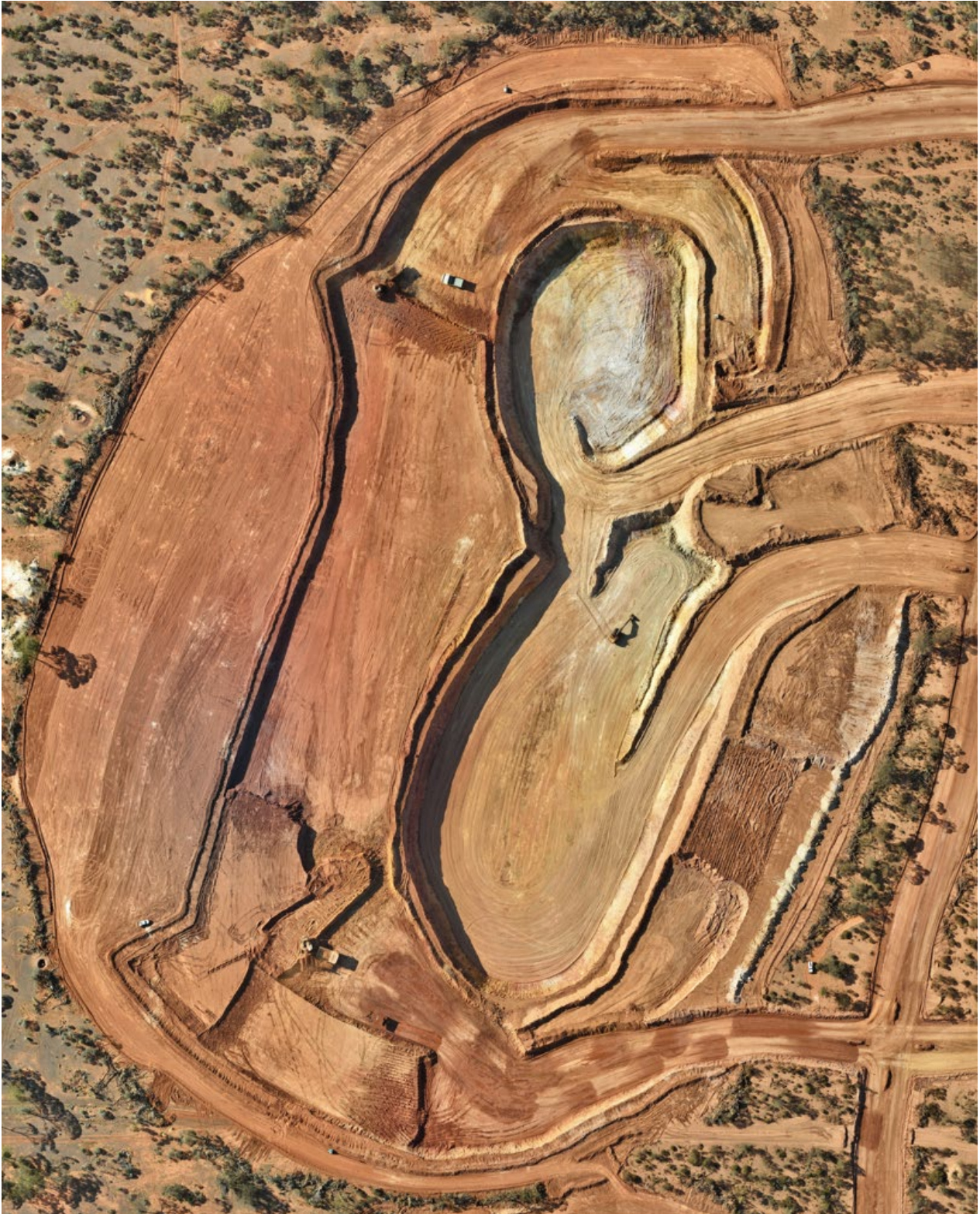
Figure 3: Aerial view of the Myhree open pit (north top of page)