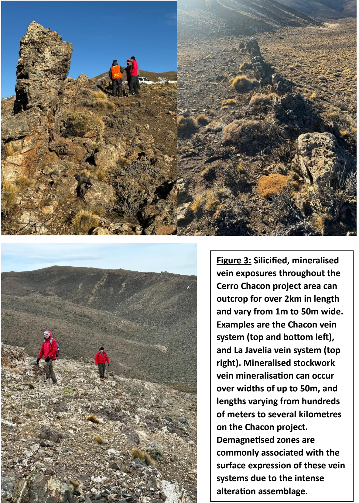
Figure 3: Silicified, mineralised vein exposures throughout the Cerro Chacon project area can outcrop for over 2km in length and vary from 1m to 50m wide. Examples are the Chacon vein system (top and bottom left), and La Javelia vein system (top right). Mineralised stockwork vein mineralisation can occur over widths of up to 50m, and lengths varying from hundreds of meters to several kilometres on the Chacon project. Demagnetised zones are commonly associated with the surface expression of these vein systems due to the intense alteration assemblage.