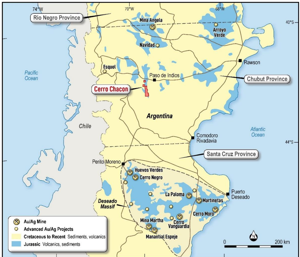
Figure 2: Location of Piche's Cerro Chacon Project

Previously the Chacon Grid had been mapped and sampled over a strike length of two kilometres, but recent reconnaissance has indicated the structure may extend for a strike length of up to six kilometres. It is expected that further mapping, geochemistry, geophysics and drilling along strike and between both the Chacon Grid and the La Javiela vein systems will highlight a mineralised structural corridor up to 10km in length.