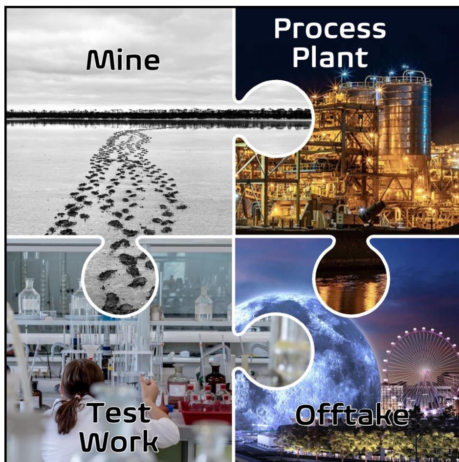
Figure 2. The four pieces of the Lake Hope Pre-Feasibility Study Jigsaw Puzzle.

The appointment of the Marketing Manager continues to add to the significant progress being made on the four main parts of the PFS for Lake Hope: the proposed mine at the lake itself; test work to optimize the metallurgical process; the associated planned full-scale 10,000 tonnes per annum process plant; and marketing, product development and offtake agreements for the final HPA products (Figure 2 and ASX Releases July 10 th 2024 and August 12 th 2024).