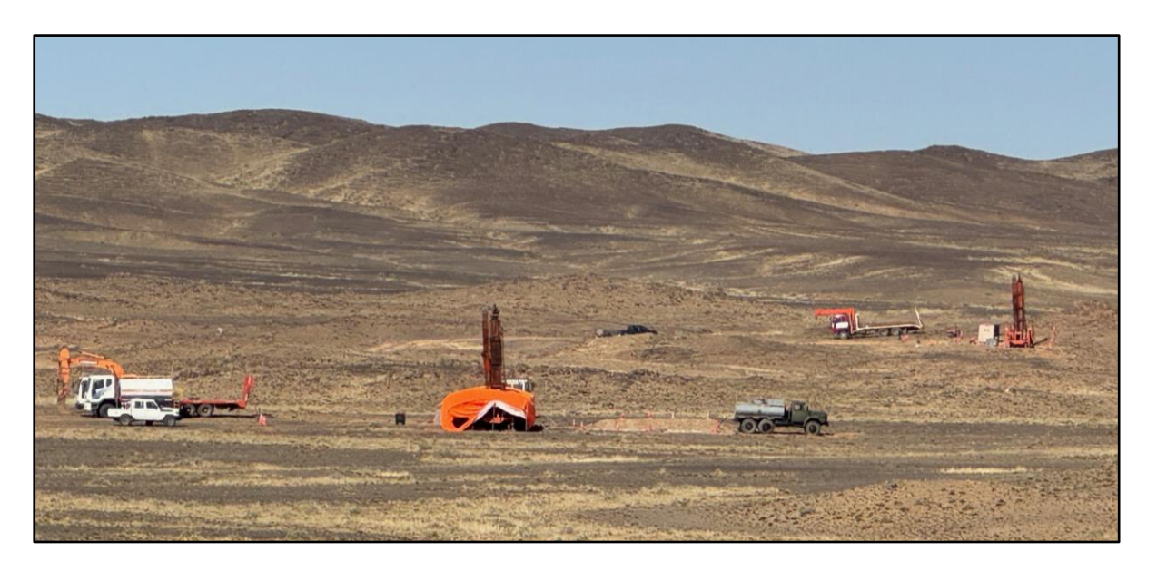
Figure 1: Litho drilling diamond core rigs at Bronze Fox

Woomera is earning an 80% interest in the Bronze Fox Project from Kincora Copper Limited (ASX: KCC) by expenditure of US$4m and has to the right to acquire a 100% interest.