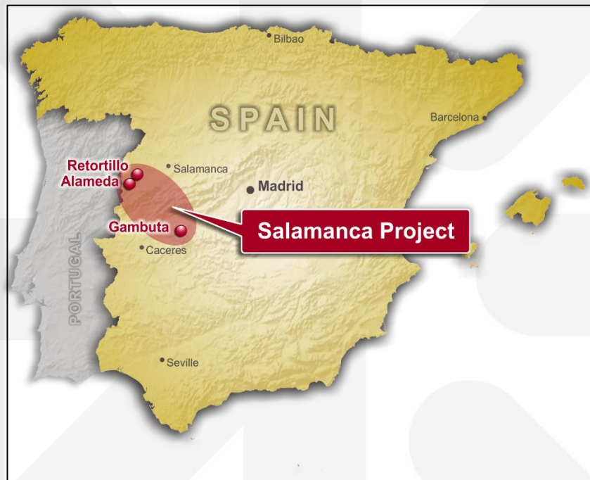
Figure 1: Location of the Salamanca Project, Spain

The Project hosts a Mineral Resource of 89.3Mlb uranium, with more than two thirds in the Measured and Indicated categories. In 2016, Berkeley published the results of a robust Definitive Feasibility Study ( DFS ) for Salamanca confirming that the Project may be one of the world's lowest cost producers, capable of generating strong after-tax cash flows.