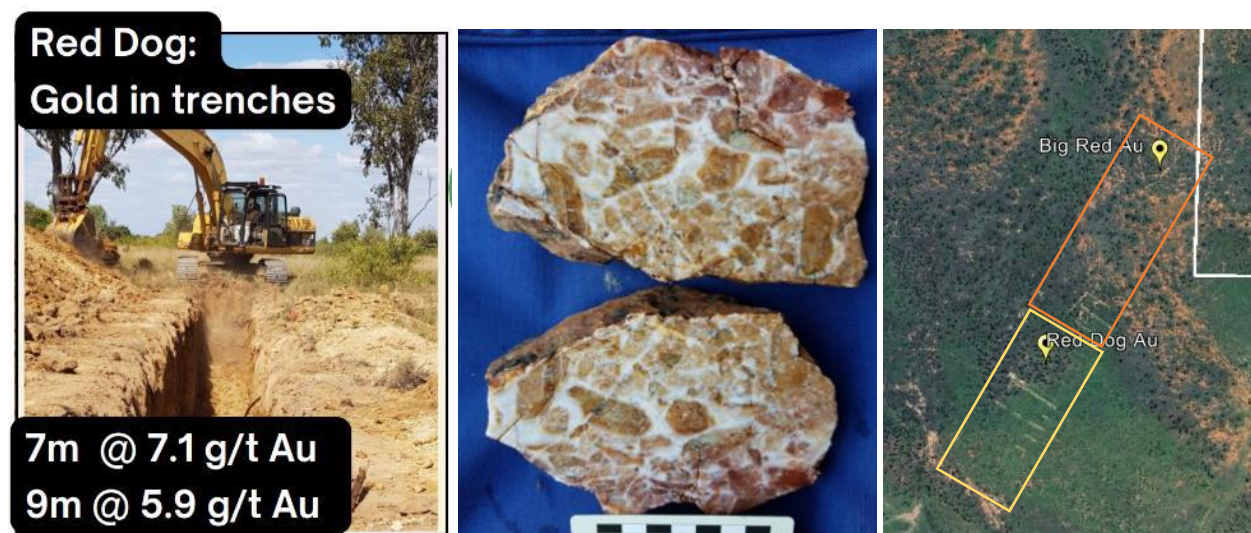
Figure 2: Big Red (Red Dog) Project –Past trenches; quartz breccias; area of past trenches (yellow rectangle) and planned extensions (orange rectangle)

These results produced a drill ready target, but that drill program was delayed twice due to weather and soft ground ( ASX announcement 13 July 2021, 31 April 2022 ). Further trenching is planned to extend the current zone of high-grade gold mineralisation prior to a drilling program over a number of shallow targets. The Company believes the potential of Big Red may be similar to nearby Twin Hills deposit with 1.0Moz (23.1Mt@1.5g/t Au) incl 49m @5.2g/tAu and Lone Sister 0.48Moz (12.5Mt@1.2g/t Au) incl. 28m @45.2g/t Au ( c.f. ASX:GBZ announcement 5 Dec 2022, 28 Apr 2023, 9 Jun 2023 ). No ground exploration was undertaken at the projects during the quarter.