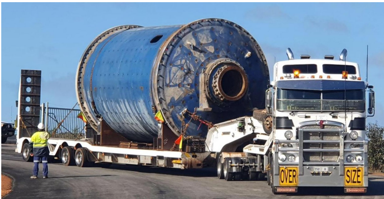
Figure 1: One of Black Cat’s two ball mills that will be utilised in the enlarged Kal East processing facility.