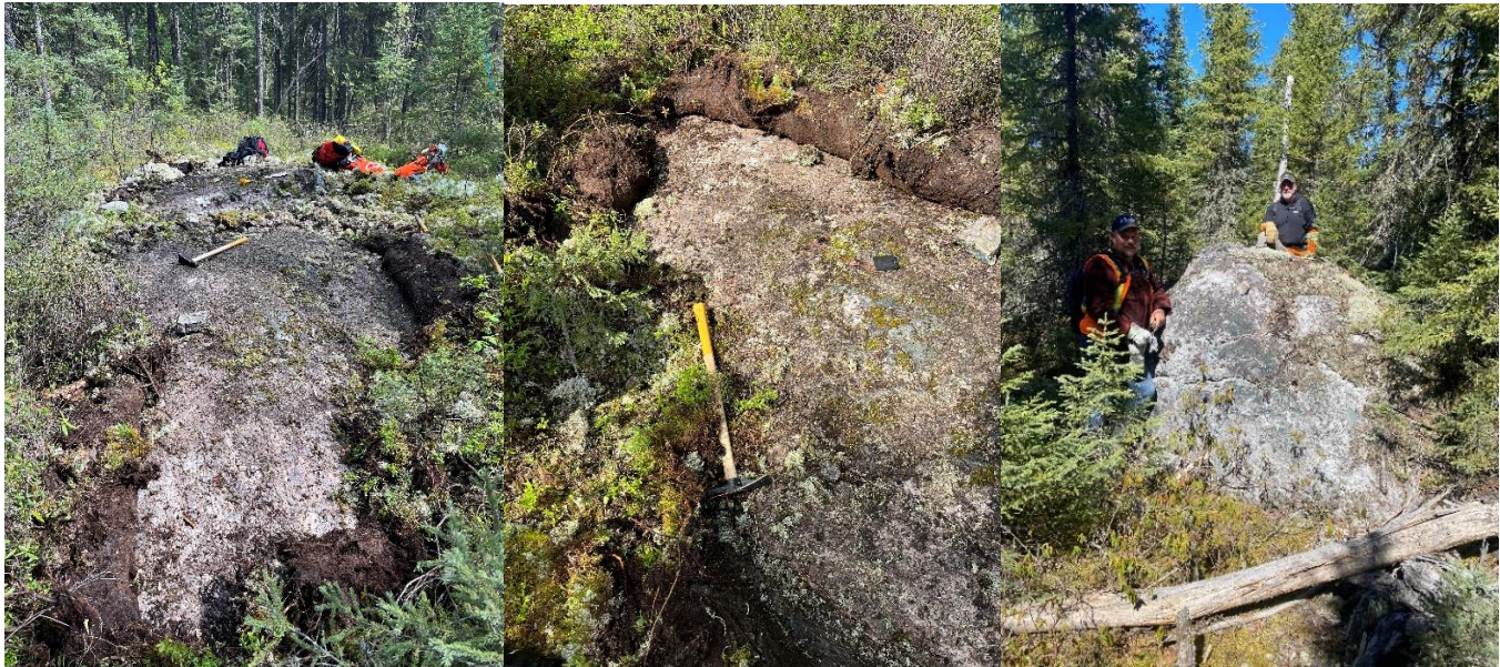
Figure 3. Spodumene-bearing Pegmatite Outcrops located on Main Zone at Despard (Northing 5586703, Easting 422232)