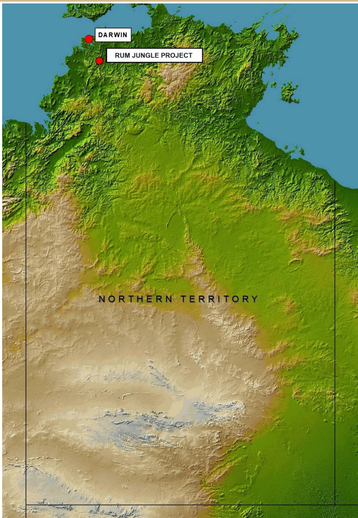
Figure 2 Location of Rum Jungle Project