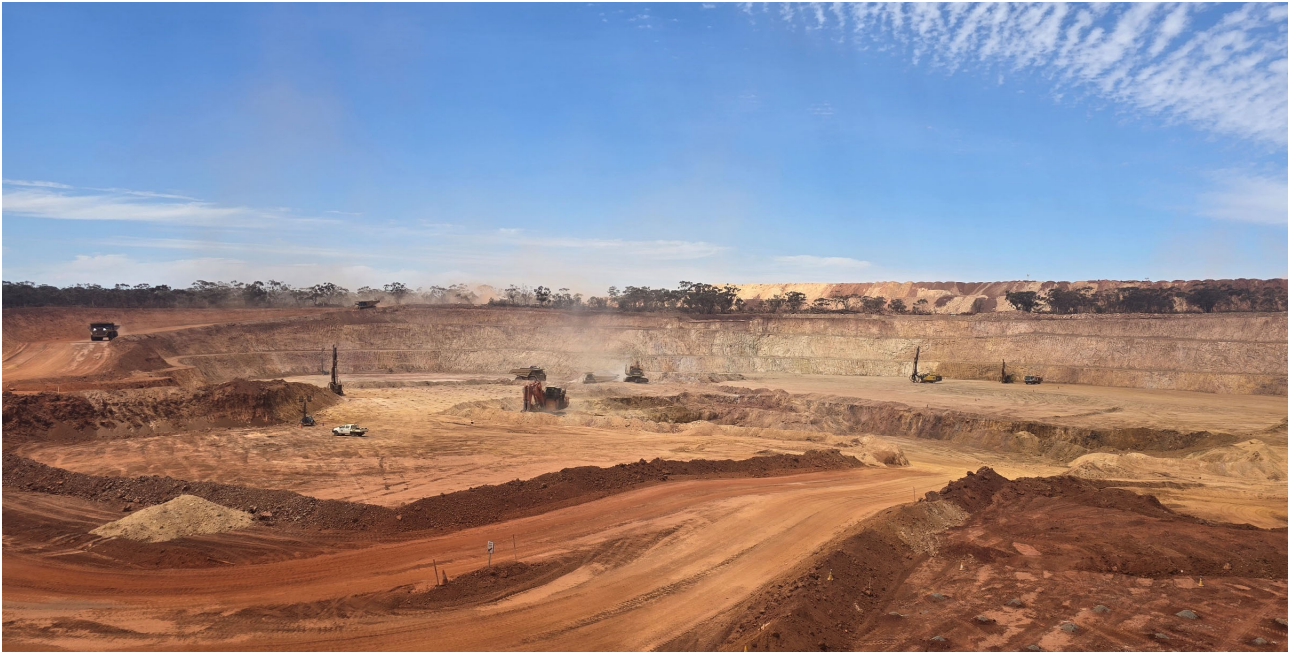
Figure 1: Myhree open pit (looking north) with multiple dig fleets and drill and blast activities

Black Cat’s Managing Director, Gareth Solly, said: “ Excellent progress is being made at Myhree/Boundary with accelerated mining delivering ~110kt of Ore, well ahead of schedule. Expedited cashflow from Myhree/Boundary will complement the recent $80M placement and underpin Black Cat producing more gold, sooner from multiple operations. ”