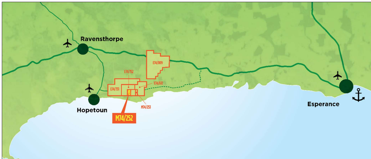
Figure 1: Location of the Springdale mining leases

Together, mining leases M74/0252 and M74/0253 – the granting of which was announced last week – cover nearly 100% of the existing mineral resources at the Springdale Graphite Project (refer Table1) 1 .