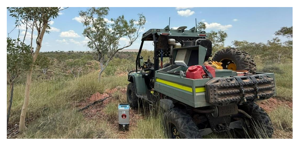
Photo 1: Blue Devil project gravity station data reading station in action.