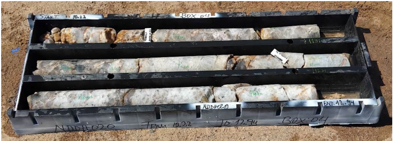
Photograph 2: Core from hole NDDH020 from 10.22 to 12.94m. Project geologists logged this interval as having up to 20% spodumene 4 .