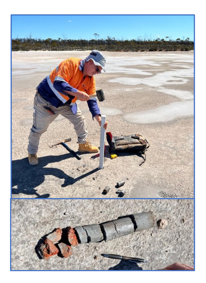
Figure 2. Lake Hope showing the push tube sampling method used to drill out the resource and an example of the lake clay from the push tube showing excellent sample recovery.

About 60% of the Measured Resource lies within West Lake, over which Impact recently pegged a Mining Lease Application (ASX Release August 12th, 2024). When required, further low-cost push-tube sampling of the lake can significantly increase the size of the measured resource (Figure 2).