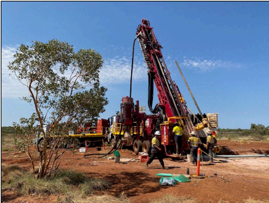
Photo 1: RC Drilling at the Nobles Nob West Prospect

Emmerson Resources Limited (ASX: ERM ) is pleased to advise that RC drilling has commenced on its Tennant Creek project in the Northern Territory (Figure 1). The programme includes approximately 5,000m of RC drilling targeting the Nobles Nob West prospect and the White Devil deposit and is expected to continue for around 4 weeks.