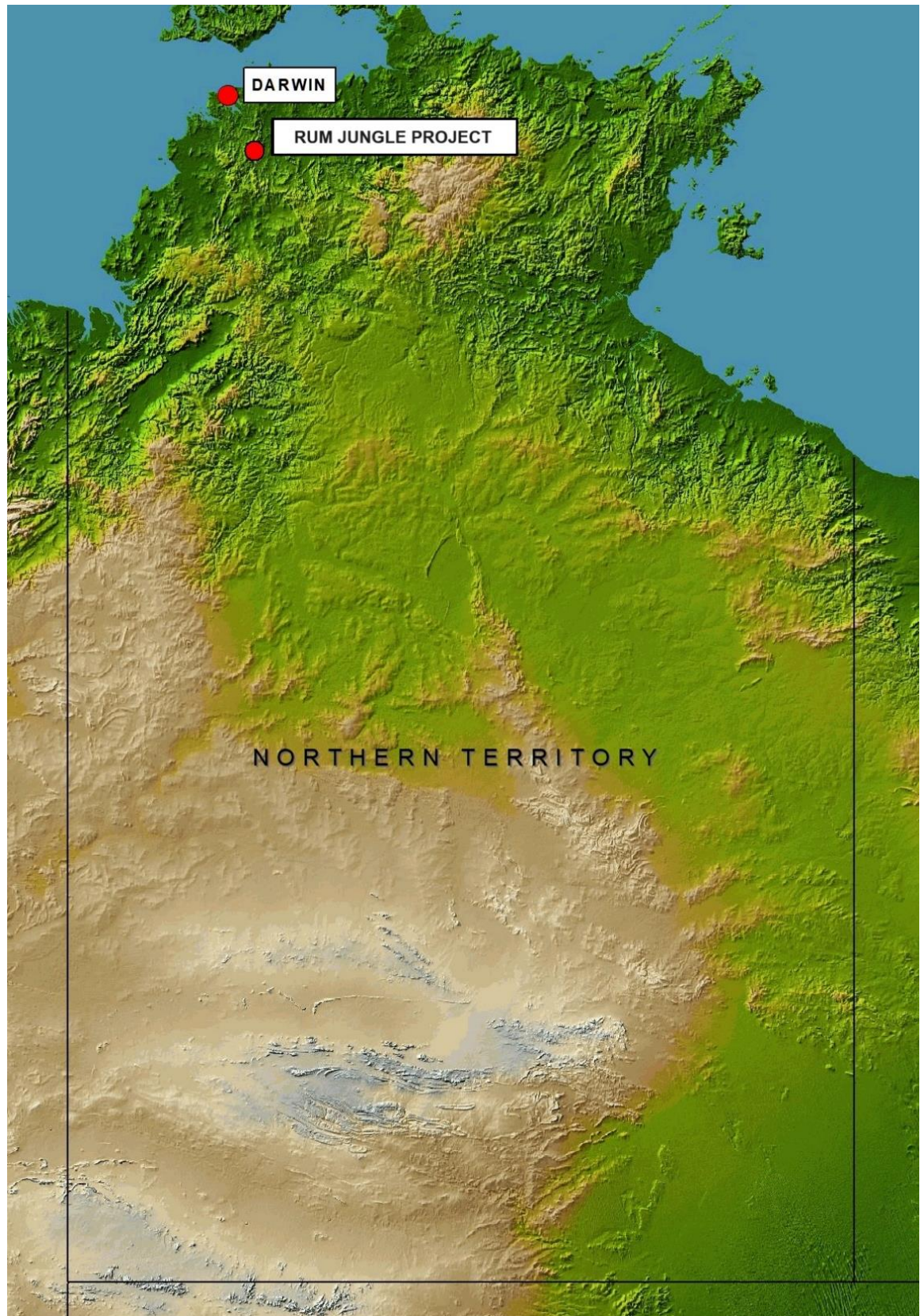
Figure 2 Location of Rum Jungle Project