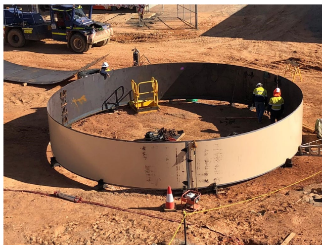
Figure 6: Fabricating tank skins, November 2024.