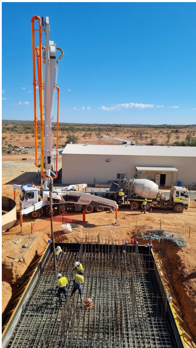
Figure 3: Concrete pour for ball mill foundation, November 2024.