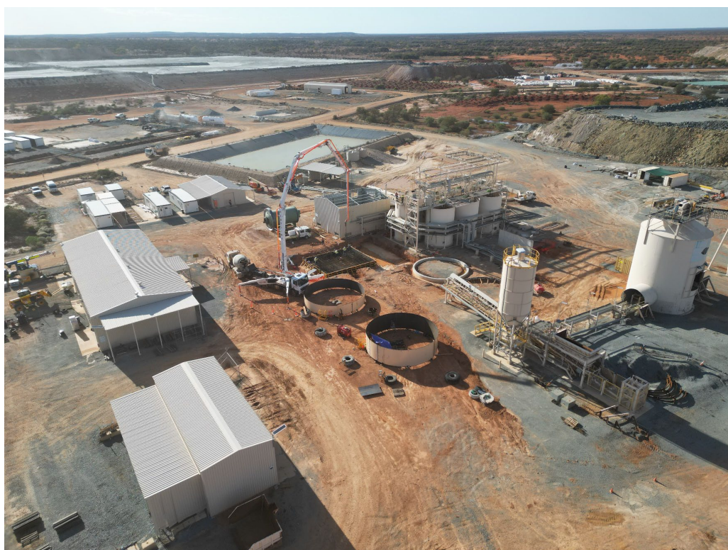
Figure 2: Drone image of ball mill foundation works and ongoing tank skin fabrication, November 2024.