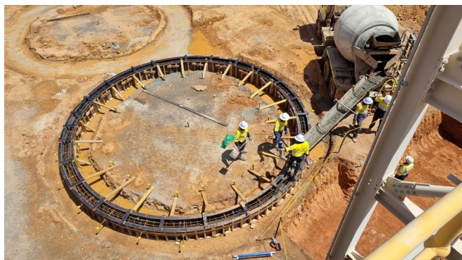
Figure 4: Concrete pour for tank ring beams, November 2024.