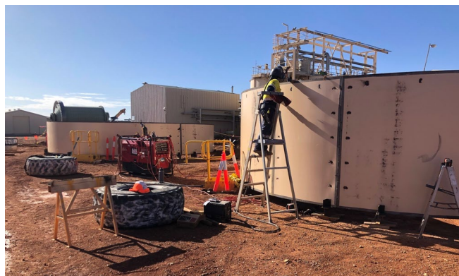
Figure 7: Fabricating tank skins, November 2024.