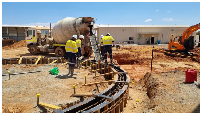
Figure 5: Concrete pour for tank ring beams, November 2024.