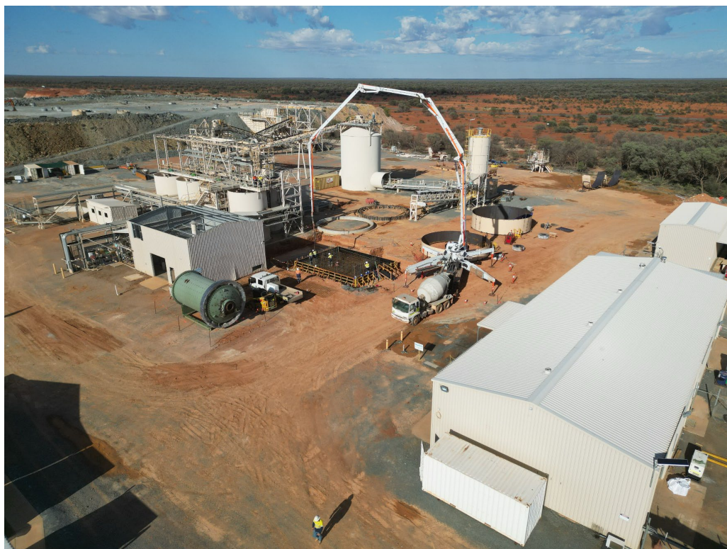
Figure 1: Drone image of concrete pour for ball mill foundation in the foreground and ongoing tank skin fabrication visible in the background behind the concrete pump, November 2024.

Meeka Metals Limited (“ Meeka ” or the “ Company ”) is pleased to provide a pictorial update of the substantial progress made during November 2024.