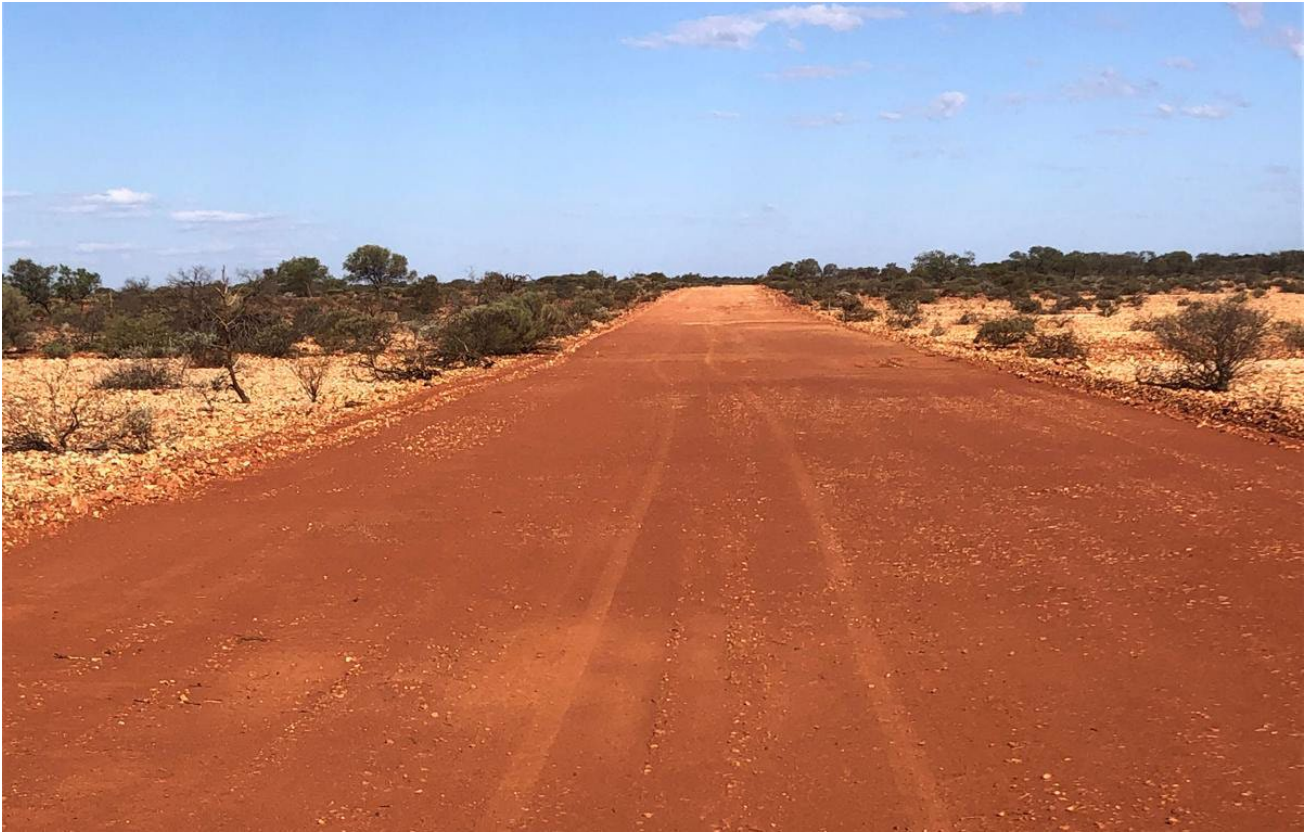
Figure 9: New 20km haul road, November 2024.