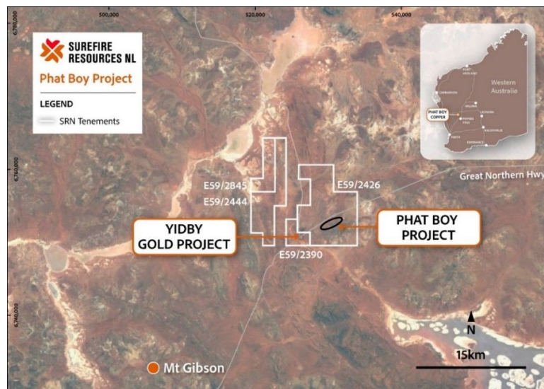
Figure 1: Location map.

All samples will be transported to the laboratory for XRF analysis, including copper, cobalt, molybdenum, and also for rare-earth elements (REE) analyses. Results are expected within the next few weeks subject to laboratory schedules.