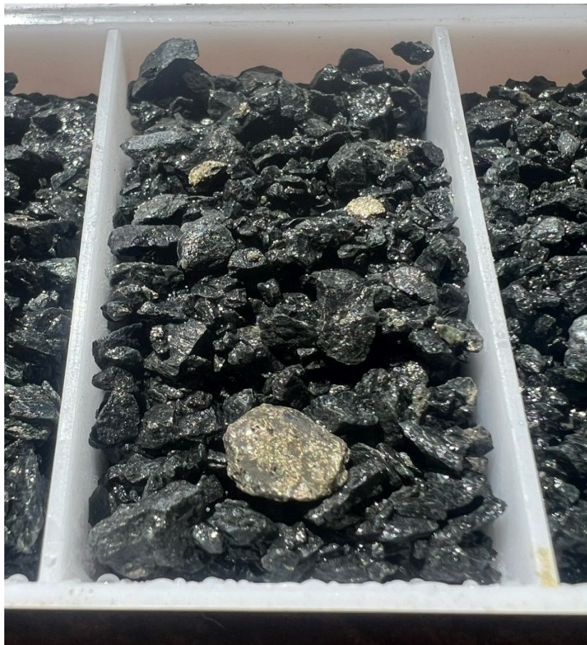
Plate 1: Sulphide blebs within fine grained disseminated vein sulphides within volcanic rock.

The drilling intersected a sequence of dark volcanic clays followed by disseminated sulphides in black volcanic fresh rock beneath the anomalous copper and zinc soil geochemical anomalous zones. The drilling included approximately 50m of continuous disseminated sulphides in veins, with occasional sulphide blebs, (visual estimate up to 1-2% sulphide abundance) within black volcanic rock (see plates 1,2, table 1).