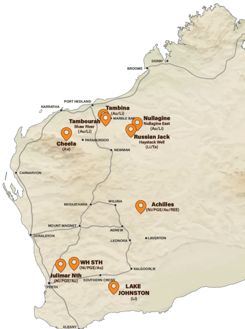
Figure 2: Tambourah Metals Project Locations