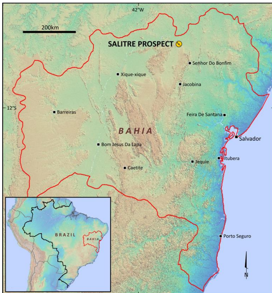
Figure 3: Alderan Resources Salitre Lithium project locations in Bahia, Brazil.