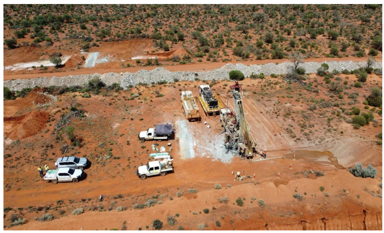
Figure 2 – Photo showing the RC Drill rig on the western side of the Coogee Pit Wall