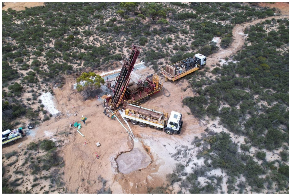
Phase 3 RC drilling at the Louie Prospect

The samples collected during the campaign have been submitted for assay in Perth, with results expected early next year. The Company remains on track to commence aircore drilling in January/February 2025, a program designed to test ~8km of highly prospective, untested strike.