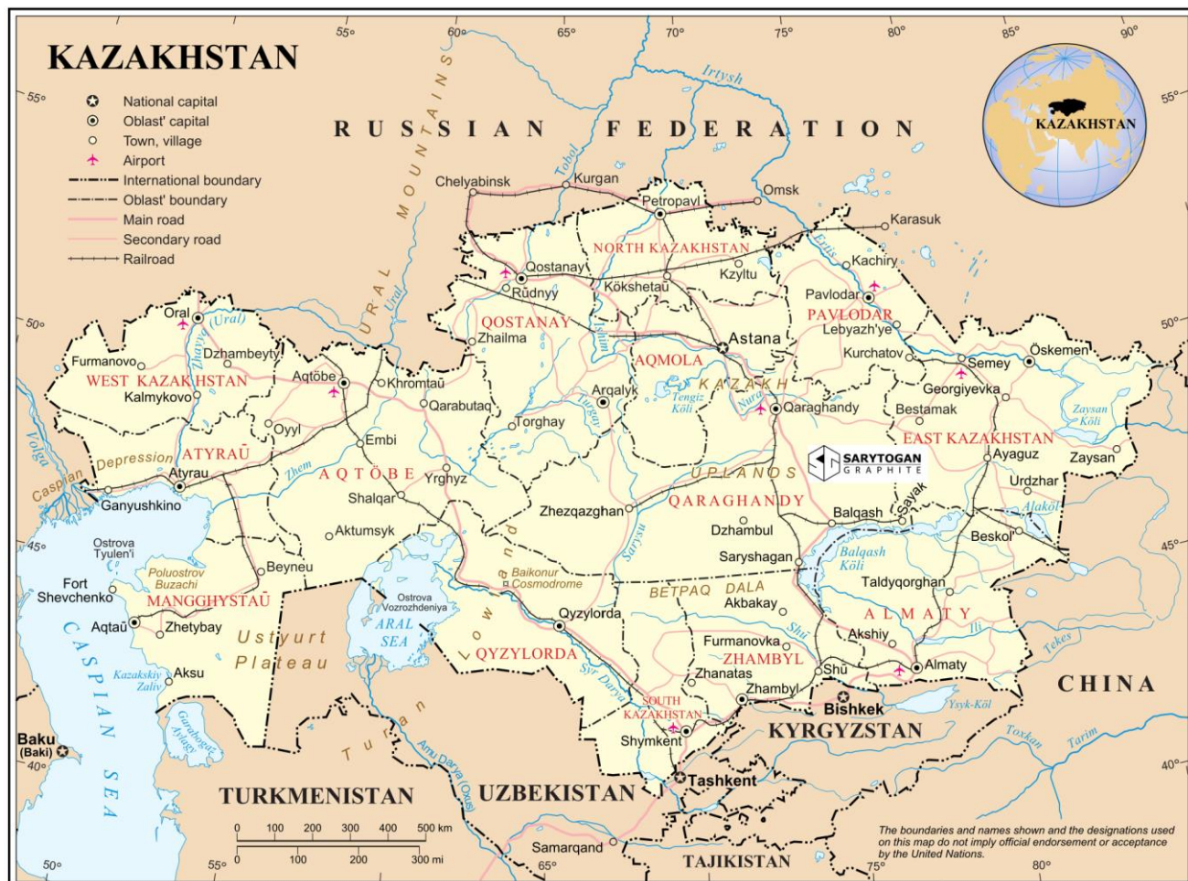
Figure 2 - Sarytogan Graphite Deposit location.

The Sarytogan Graphite Deposit is in the Karaganda region of Central Kazakhstan. It is 190km by highway from the industrial city of Karaganda, the 4th largest city in Kazakhstan (Figure 2).