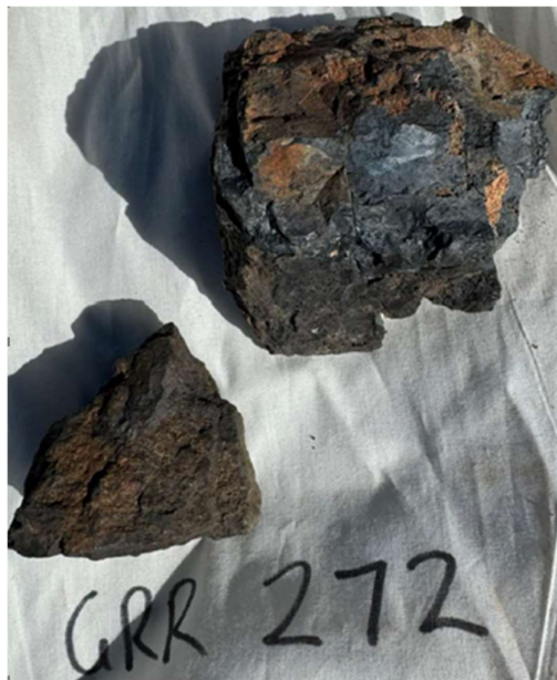
Figure 3: High-grade massive black manganese oxide mineralisation, 54.50% Mn, Sample GRR272