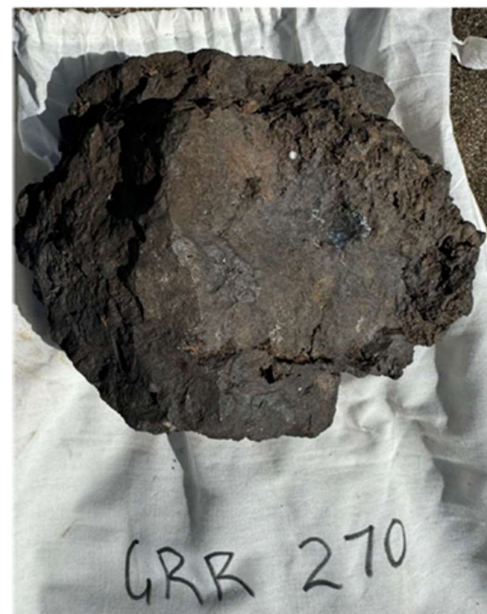
Figure 4: High-grade massive black manganese oxide mineralisation, 53.50% Mn, Sample GRR270