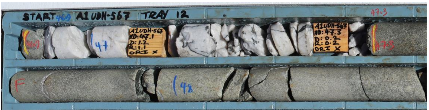
Figure 2: Drillhole A1UDH-567 showing the second mineralised intercept

The second mineralised vein included several greasy, erratic sulphidic-stylolitic veinlets and was encountered from 46.9-47.3m (Figure 2).