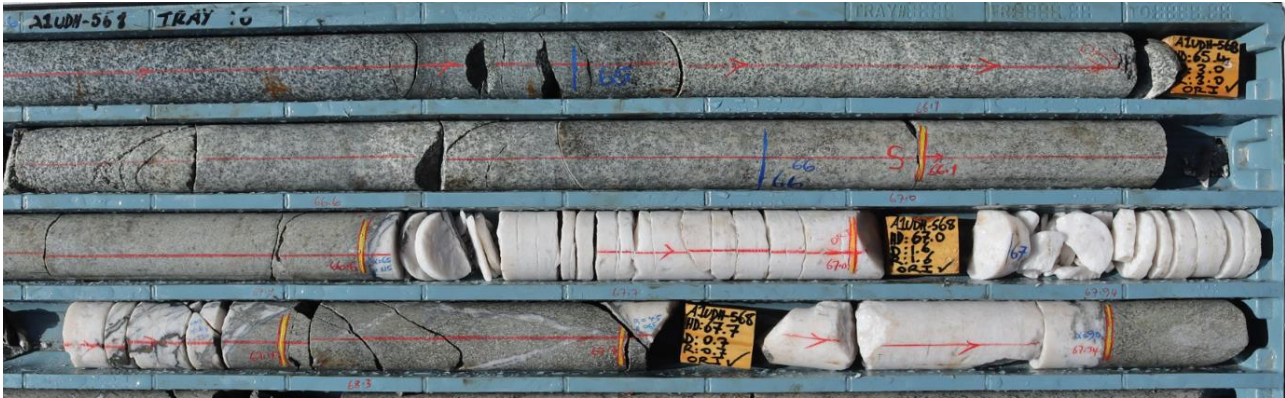
Figure 3: Drillhole A1UDH-568 showing a quartz intercept

Hole A1UDH-568 was targeting the Bass Reef and parallel structures and/or potential orthogonal structures within the diorite dyke. One significant quartz structure was identified (Figure 3). Both contacts are significantly stylolitic but no visible gold was noted.