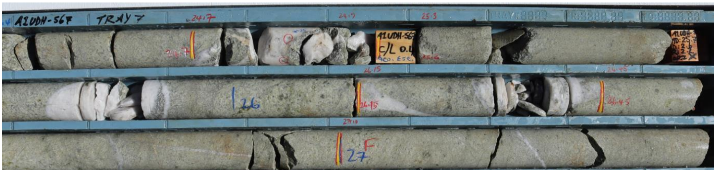
Figure 1: Drillhole A1UDH-567 showing the first mineralised intercept

Visible gold was noted in the brecciated quartz and moderately altered dyke from 24.7-24.9m. Unfortunately, 0.4m of core was lost during this drilling (Figure 1). The lost core may be underreporting the width and grade of this intercept.