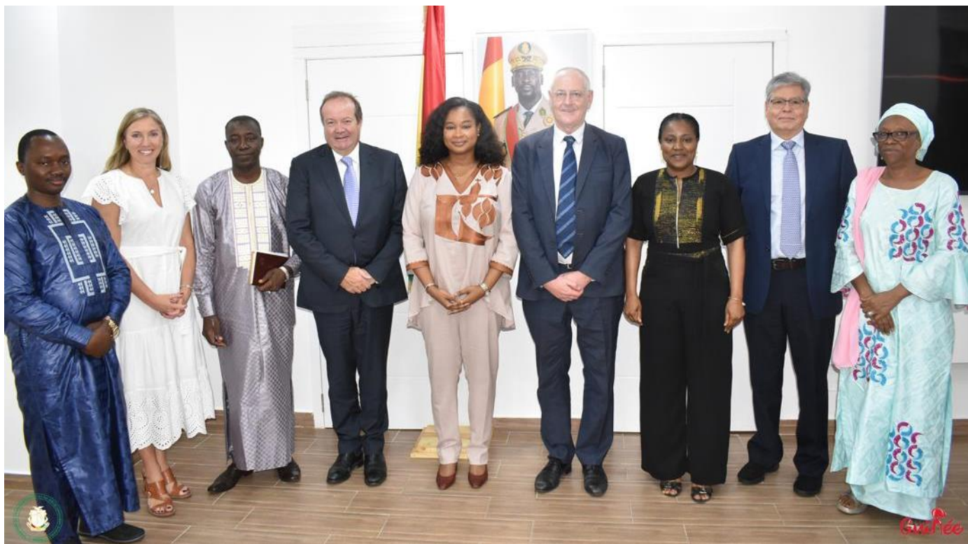
Figure 3: PDI meeting with the Minister of Environment and Sustainable Development and officers