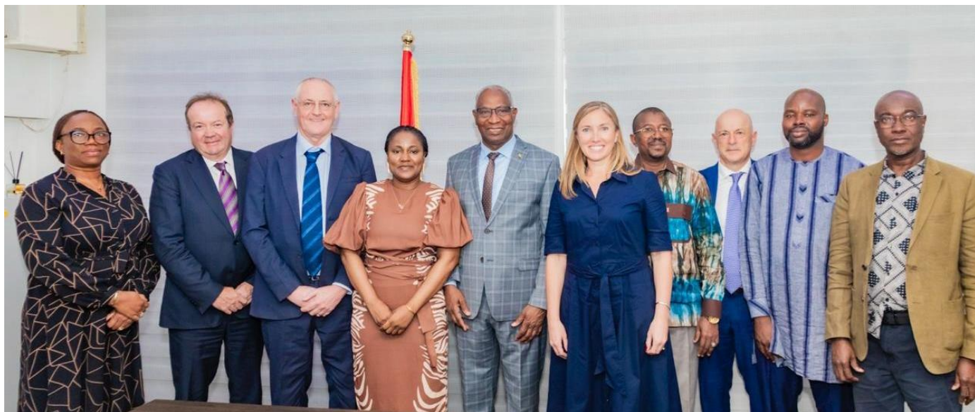
Figure 2: PDI meeting with the Prime Minister and officers