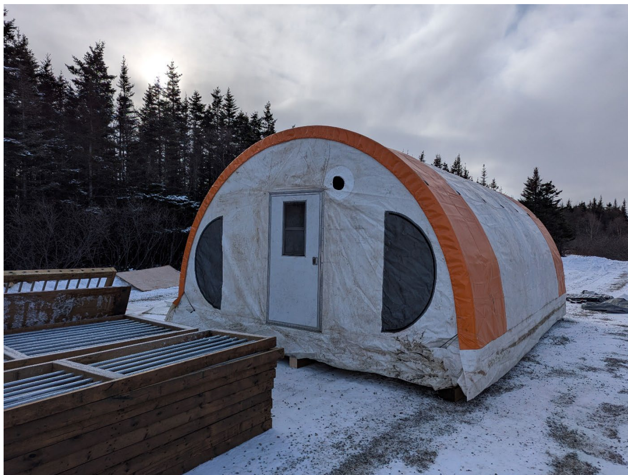
Figure 3: One of the core logging tents set up for use when the diamond drilling campaign commences. Storage and handling trays are in the foreground with snow on site already visible and temperatures averaging -2°C.

Infini field staff are now well underway with setting up temporary drill core handling structures which includes two tents for core logging, one tent for core cutting and racks for temporary core storage (Figure 3). In addition to this diamond core work area, the Company will be utilising Imago software for its core photography data storage purposes which works seamlessly with 3D geological modelling software. Snow clearing and camp site support will be provided to the Company under an agreement with the local owners of Mountain Waters Resort. This will ensure that access is always maintained between the accommodation and work areas for field and drilling staff as they come into and out of the field via snowmobile and helicopter.