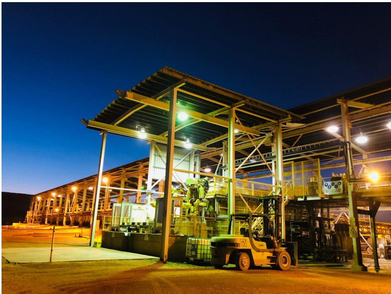
Figure 2: Mount Kelly Copper Processing Facility

Both groups agree to work towards achieving a mutually beneficial outcome which would then lead to agreeing commercial terms and producing formal documentation.