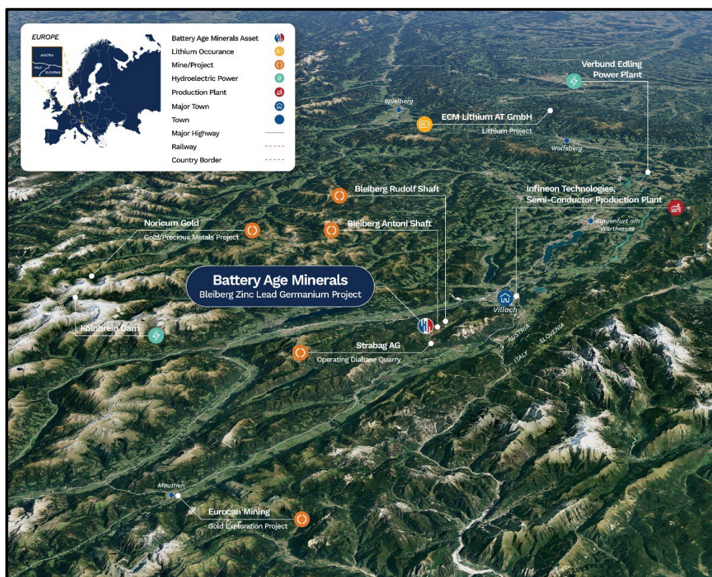
Figure 2: Bleiberg Zinc Lead Germanium Project located in the state of Carinthia, Austria.