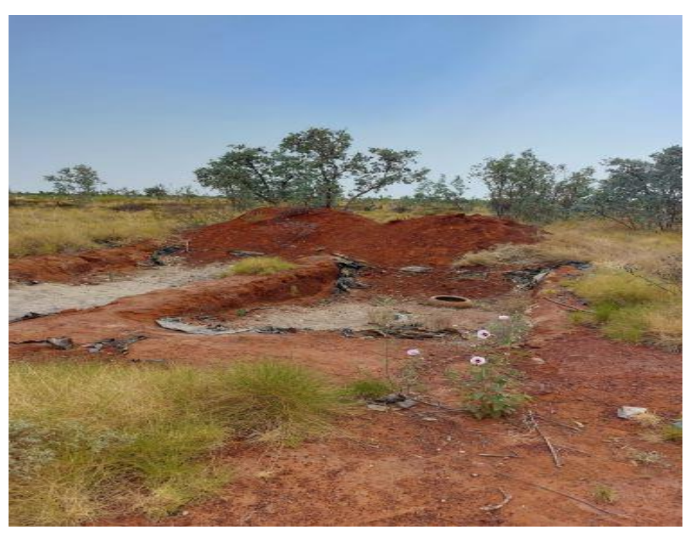
Figure 1: Jumping Spider Sump – Liners and rubbish obvious

Assessment of the rehabilitation requirements for the clean-up of previous drill pads and sumps showed that several of the sumps still had the liners in place (Figure 1). As part of the field work, these were removed and taken to a site (at Camooweal) for appropriate disposal.