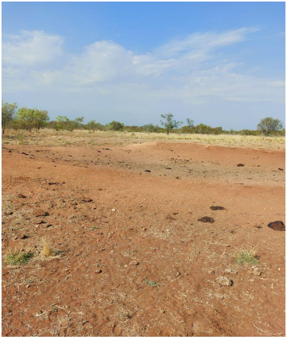
Figure 2: Roadhouse Sump

The nature and level of rehabilitation work that is still required is illustrated by Figures 2. With the removal of the sump liners, most of the outstanding rehabilitation will only involve having the sumps backfilled and levelled.